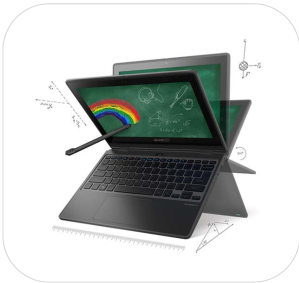
Acer TravelMate Spin B3